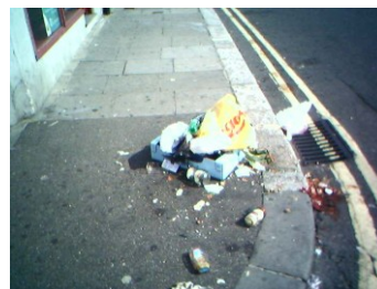
Litter in Victoria Avenue

During the summer, many of you have complained to your local councillors about problems with refuse collection and street cleansing in Hastings, and around Tressell Ward in particular. These problems were