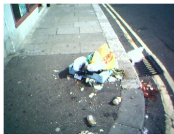
Litter in Victoria Avenue

During the summer, many of you have complained to your local councillors about problems with refuse collection and street cleansing in Hastings, and around Tressell Ward in particular. These problems were