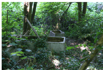
Remains of the old piggery

Local residents and Tressell councillors are continuing their struggle to preserve the Upper Ore Valley (the open space between