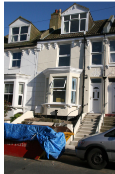
Refurbished house in Emmanuel Road

ten years or more. In all seven cases, owners are now bringing them back into use or have put them on the market. One of them was in Tressell Ward, at 68 Emmanuel Road – which is now refurbished and back in use. Another 14 notices have now been served, including two more in Tressell Ward. Extra housing is badly needed in Hastings – we'll keep