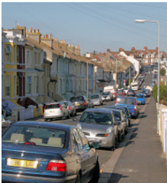
St George's Road: Room for bins?

Three years ago, the council consulted residents in the Mount Pleasant area on proposals for communal rubbish bins. From this, it was clear that many people believed the bins would cause problems by cutting down