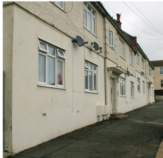
Dog Fouling problem

Local councillors recently carried out an inspection of the area, with officers from Amicus Horizon housing association. We found a number of small problems around the social