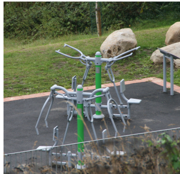
Adult exercise equipment

Recently, the council opened a new play area, in the Bembrook Road open space. This is about five minutes' walk away, along Bembrook